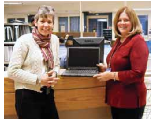
BIDMC staff members with one of our donations.

We’ve held numerous events to fund donations to the bone marrow transplant units. We have purchased VCRs, boom-boxes, and laptop computers so that patients can access the internet and stay in touch with loved ones. These computers make a big difference in the lives of patients who, unable to leave their rooms for a month or more, can still stay connected to the outside world. ■