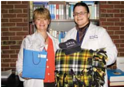
YNHH staff members with some of our gifts.

And our goals and influence have spread—originally from just Beth Israel-Deaconess Medical Center in Boston, to Yale-New Haven Hospital in Connecticut and to Memorial Sloan-Kettering Cancer Center in New York.